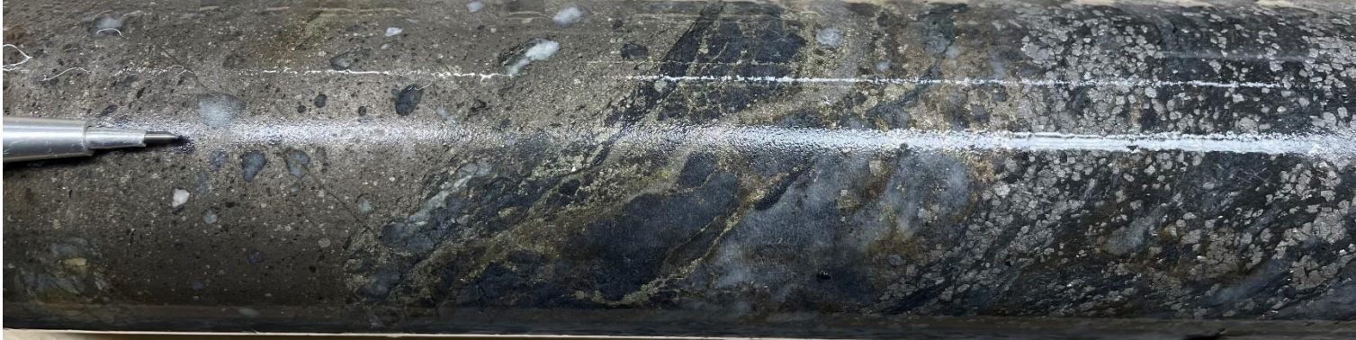
Figure 3: SOR23010: pyrrhotite-pyrite breccia (108.5 g/t Au over 0.5 m from 105.8 m) with quartz-dolomite vein fragments and minor sheared graphitic mudstone. Abundant disseminated medium-grained barren arsenopyrite at the end of interval.